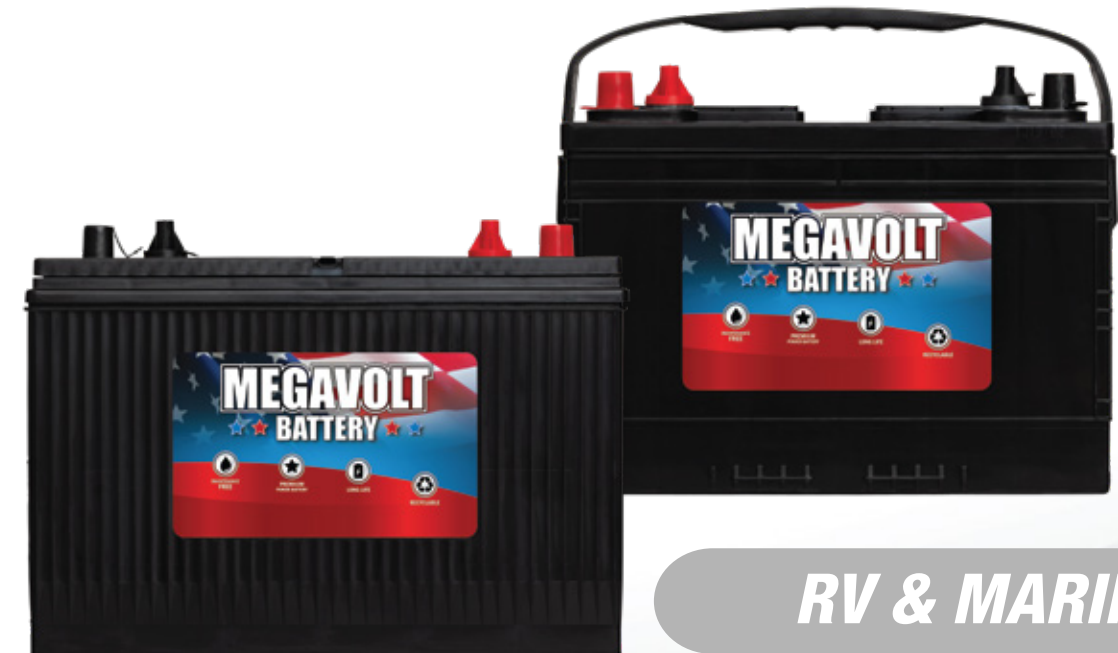
RV & MARINE