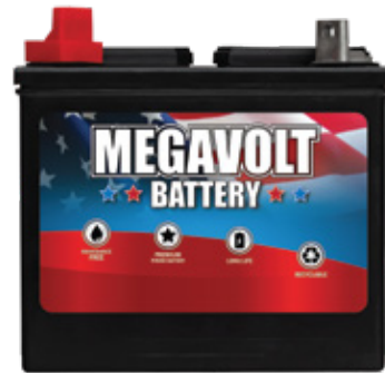
LAWN & GARDEN